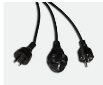
Export Plug-In (E)

120v / 60Hz A/C power with on-board charger & internal batteries