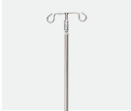
IV Pole (TMA03-15)