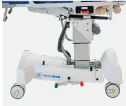
Triple Column Base (T) 24" - 40" Seat Height