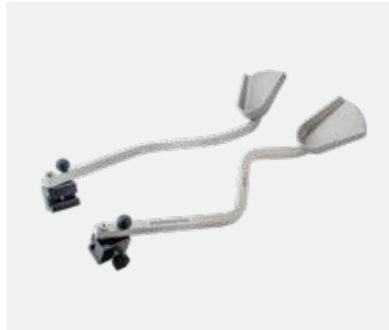
Heel Stirrups (TMA169-15)