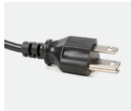
A/C Plug-In (A)

*models with this configuration will NOT have a radiolucent back