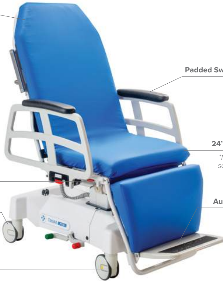
Padded Swing & Tuck Side Rails