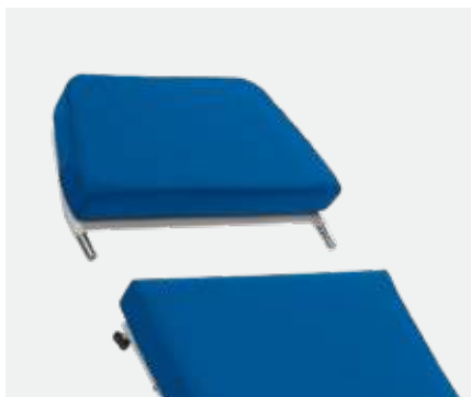
Removable ENG/VNG Headpiece (G)

*models with this configuration will NOT have a radiolucent back