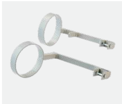
Oxygen Tank Holder For X-Models (TMA04X-15)