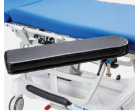
Locking Armboard: Stretcher (TMA121-15)