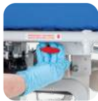
Manual Quick Release Back

Available in Sure-Check® Fusion Fabric or Healthcare-Grade Vinyl