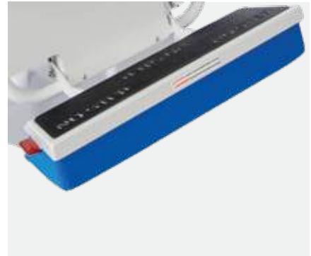
Manual Folding Footrest (F)