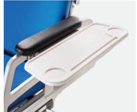
Folding Side Table (TMA223-15)