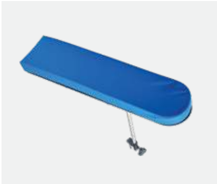
Armboard: Seated (TMA65-15)