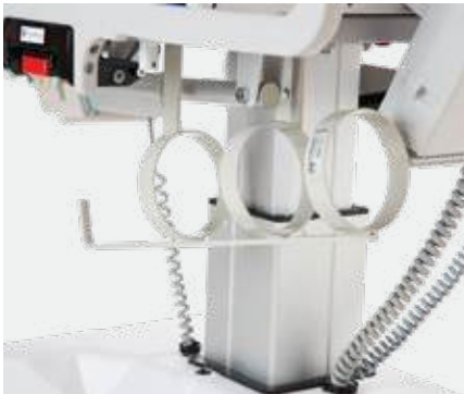
Oxygen Tank Holder For Non-X Models (TMA04-15)