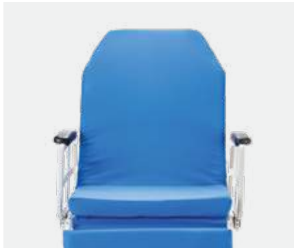
Wide (28") Seat Width (W)